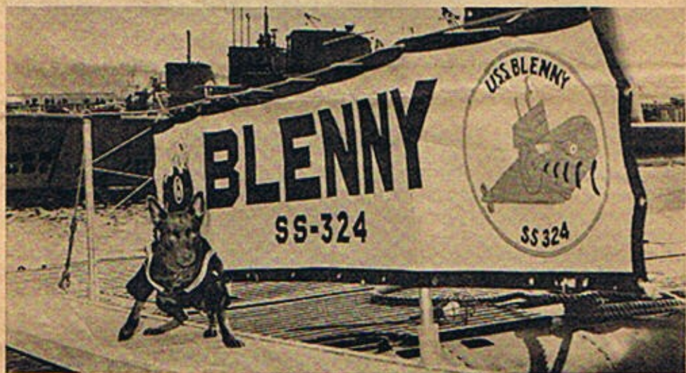
The Blenny hits port and Bozo seems just as anxious for shore leave as any tar.

He has been an American tar ever since a sailor bought him in a Yokosuka, Japan, saloon four years ago for about 30 cents.